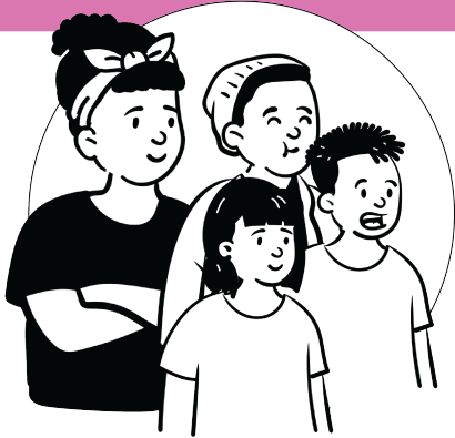
[Illustration or graphic of family]